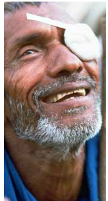
THIS MAN WAS THE RECIPIENT OF SEVA-ASSISTED EYE SURGERY IN INDIA.