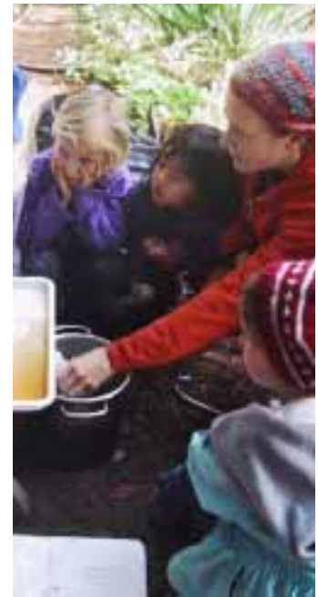
KINDERGARTEN STUDENTS FROM LINNAEA SCHOOL LEARN TO PRESS APPLE JUICE WITH LINNAEA FARM STEWARDS.

THE BRAINERD FOUNDATION THE DAVID AND LUCILE PACKARD FOUNDATION ENDSWELL FOUNDATION WALTER AND DUNCAN GORDON FOUNDATION THE J.W. MCCONNELL FAMILY FOUNDATION LIFEBRIDGE FOUNDATION THE GORDON AND BETTY MOORE FOUNDATION TIDES FOUNDATION WESTERN ECONOMIC DIVERSIFICATION CANADA THE WILLIAM AND FLORA HEWLETT FOUNDATION